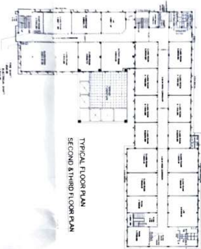
TYPICAL FLOOR PLAN SECOND & THIRD FLOOR PLAN